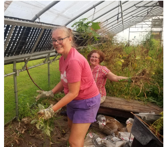
High Tunnel Outdoor Classroom