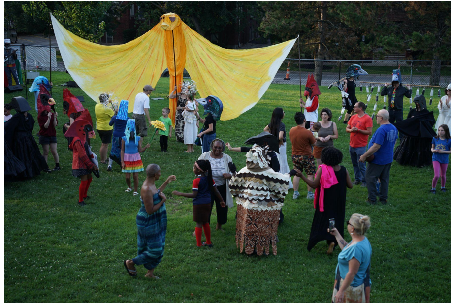
This Art is for the Birds