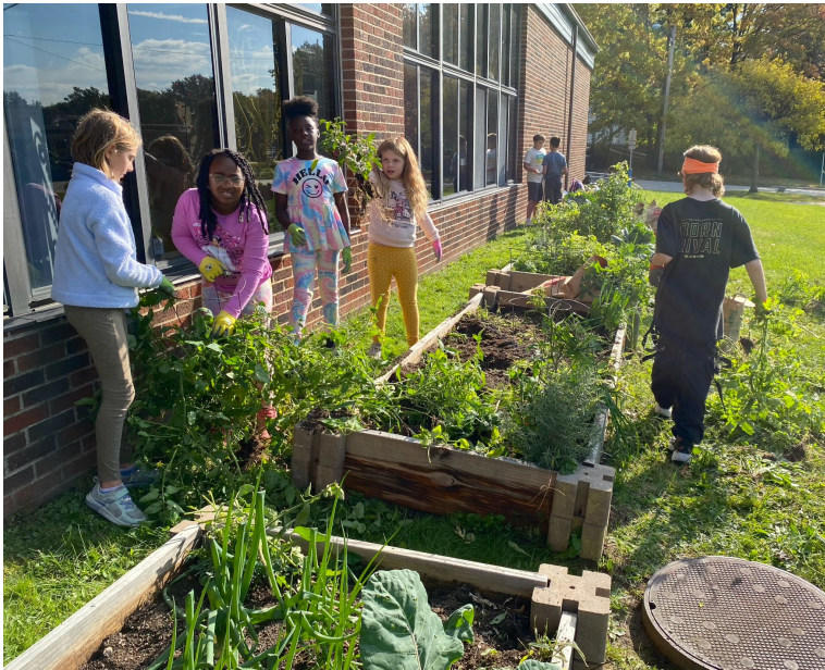
Roxboro Elementary Learning Garden

FutureHeights is proud to uplift these citizen-driven projects through the allocation of Neighborhood Mini-Grant funds and is grateful to the Cedars Legacy Fund for their continued support, which makes the program possible.