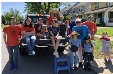
FutureHeights at the 2019 University Heights Memorial Day Parade.