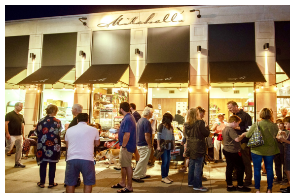
2019 Heights Music Hop attendees gather outside of Mitchell's Fine Chocolates on Lee Road.