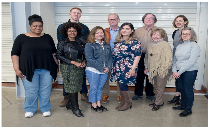
Members of the 2019 Neighborhood Leadership Workshop Series cohort at the FutureHeights Annual Meeting.

Working with Noble Neighbors, the cities of Cleveland Heights and East Cleveland, and Northeast Ohio Alliance for Hope (the CDC for East Cleveland), FutureHeights completed a $70,000 planning study of the Noble Road corridor in 2019. Camiros, Ltd., a nationally recognized urban planning firm, and The Riddle Company, a real estate and economic development marketing consulting practice, are working with FutureHeights to prepare the development and revitalization plan focusing on four commercial/mixed-use districts along Noble Road between Mayfield Road and Euclid Avenue.