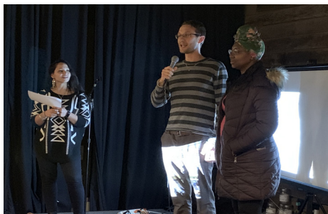
North Coventry residents give an update on their Neighborhood MiniGrant Project.