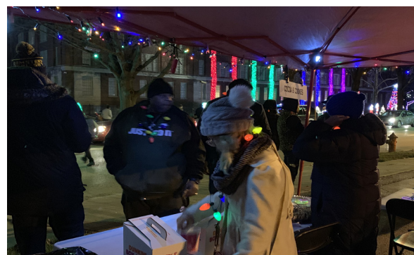
Cleveland Heights and East Cleveland neighbors gathered together on December 6th to celebrate the Noble Neighborhood.