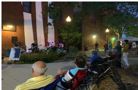
A band performs in the revitalized Cedar Lee Mini-Park at the 2019 Heights Music Hop.

Five years ago, when I retired from my job as City Planning Director in Cleveland, I began looking for a way to engage in similar work as a volunteer in my home community of Cleveland Heights.