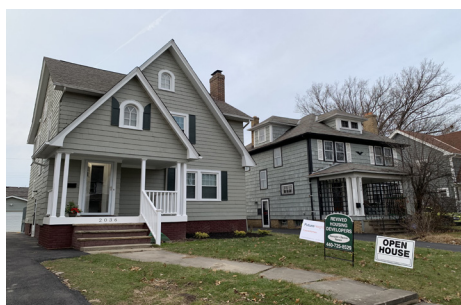
FutureHeights held a community open house at one of its FutureHomes program houses.