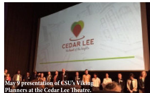
May 9 presentation of CSU's Viking Planners at the Cedar Lee Theatre.

FutureHeights sponsored a Cleveland State University student-led planning process in Cedar Lee that examined several aspects of the district, including retail mix and in-fill opportunities. A group of volunteers, organized through FutureHeights' new Economic Development Committee is using the study to develop strategies to support existing businesses and fill vacancies in the district.