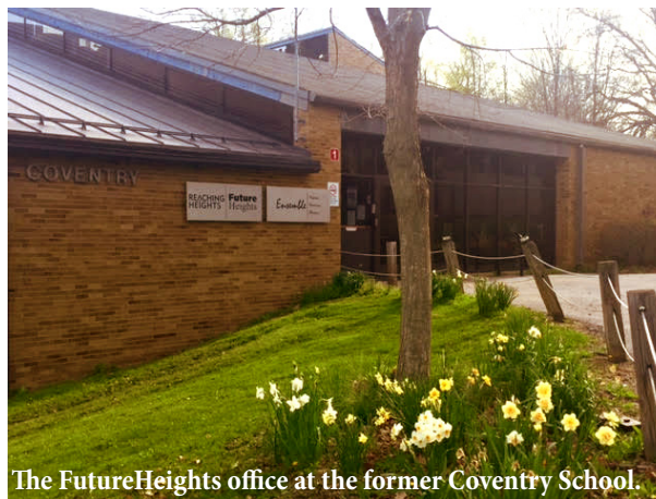
The FutureHeights office at the former Coventry School.

Your tax-deductible membership contribution goes directly to supporting the community-based programs and projects of FutureHeights that help strengthen our neighborhoods and business districts. Join online today at our secure website, www.futureheights.org , or by calling 216-320-1423.