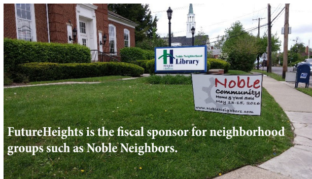
FutureHeights is the fiscal sponsor for neighborhood groups such as Noble Neighbors.

Projects that FutureHeights has funded so far include community gardens, public art, and beautification and branding initiatives. FutureHeights holds two grant application rounds, one in the fall and one in the spring. The next application deadline is March 15, 2017.