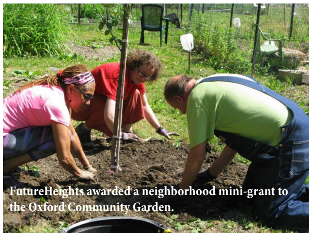
FutureHeights awarded a neighborhood mini-grant to the Oxford Community Garden.

FutureHeights hosted a public forum, Community-Building for Change , on Nov. 16, focusing on effective organizing and goal-setting for volunteer organizations, and strategies for creatively solving challenges. FutureHeights hosts public forums in response to requests from members of the neighborhood groups it works with and its Civic Engagement Committee. FutureHeights is partnering with Neighborhood Connections, a nonprofit community organizing group that serves Cleveland neighborhoods.