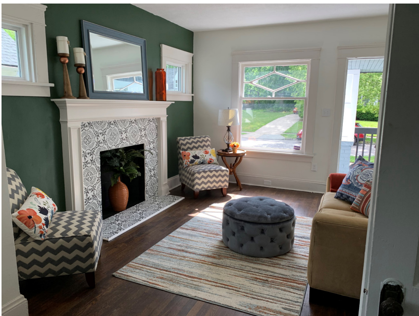
The living room of the Whitby house after renovation through the FutureHomes program.