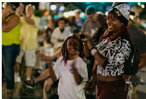
Heights residents enjoy Heights Music Hop 2021.