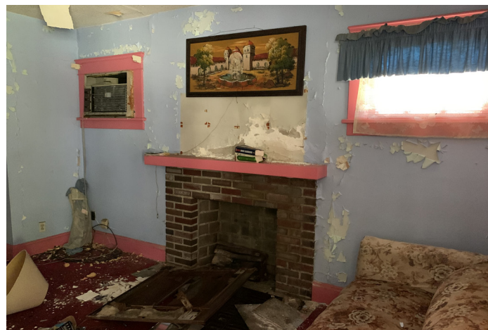
The living room of the Whitby house prior to renovation.