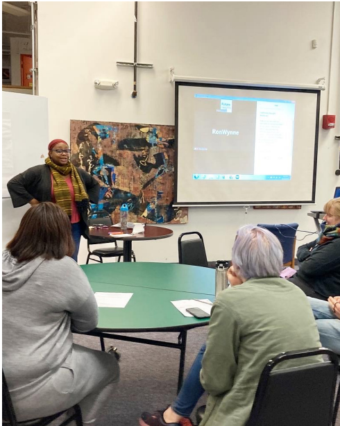
FutureHeights Neighborhood Leadership Workshop participants with facilitator.

Facilitating an equitable, prosperous and vibrant future for Cleveland Heights and University Heights, and engaging and promoting economic and social development through meaningful engagement of residents and collaboration with local organizations, businesses and governments.