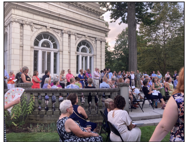
The FutureHeights 2021 annual benefit.