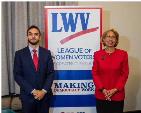
FutureHeights partnered with the Heights Chapter of the Greater Cleveland League of Women Voters to present the first ever Cleveland Heights Mayoral Debate.